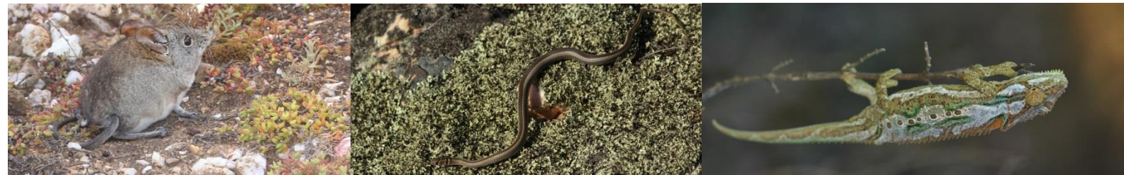
Above: Cape Rock Elephant Shrew, Cross-marked Grass Snake, Klein Karoo Dwarf Chameleon.