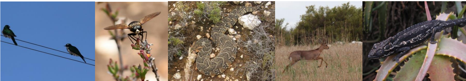
Above: Klaas’s Cuckoo pair, Long-tongued Fly, Puffadder, Steenbok, Klein Karoo Dwarf Chameleon