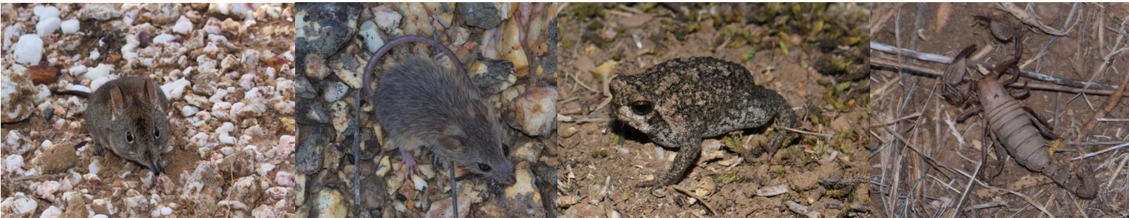
Above: Cape Rock Elephant Shrew, Namaqua Rock Mouse, Rain Frog ( Breviceps rosei vansonii ), Burrowing Scorpion