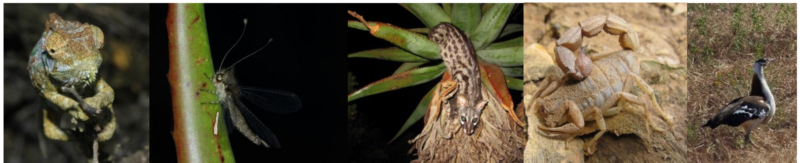
Above: Klein Karoo Dwarf Chameleon, Owl Fly, Small-Spotted Genet, Parabuthus Scorpion, Denham’s Bustard