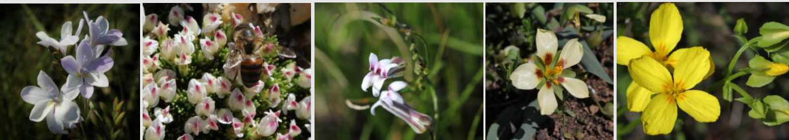
Left to right: Babiana patersoniae , Aspalathus quartzicola , Cyphia digitata , Zygophyllum sp., Sebaea exacoides

The results were spectacular—as is always the case after an autumn burn in Renosterveld. Here are some of the beauties photographed this spring.