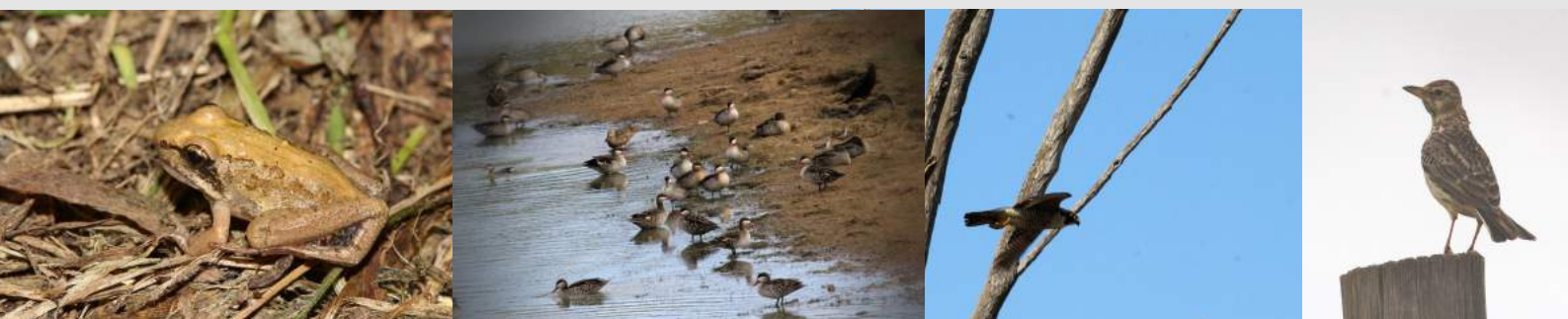
Left to right: Clicking Stream Frog, Red-billed Teals, Peregrine Falcon, Large-billed Lark