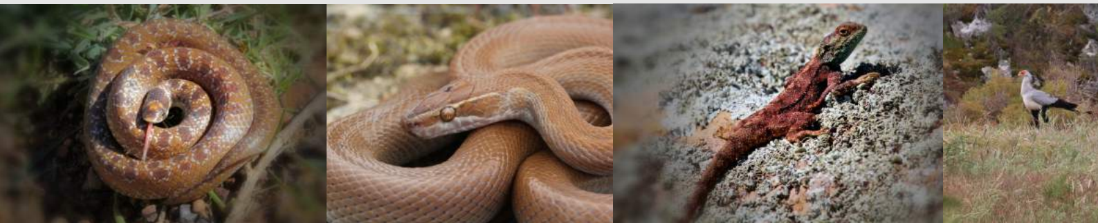
Left to right: Sundevall's Shovel Nose Snake, Brown House Snake, Southern Rock Agama, Secretarybird