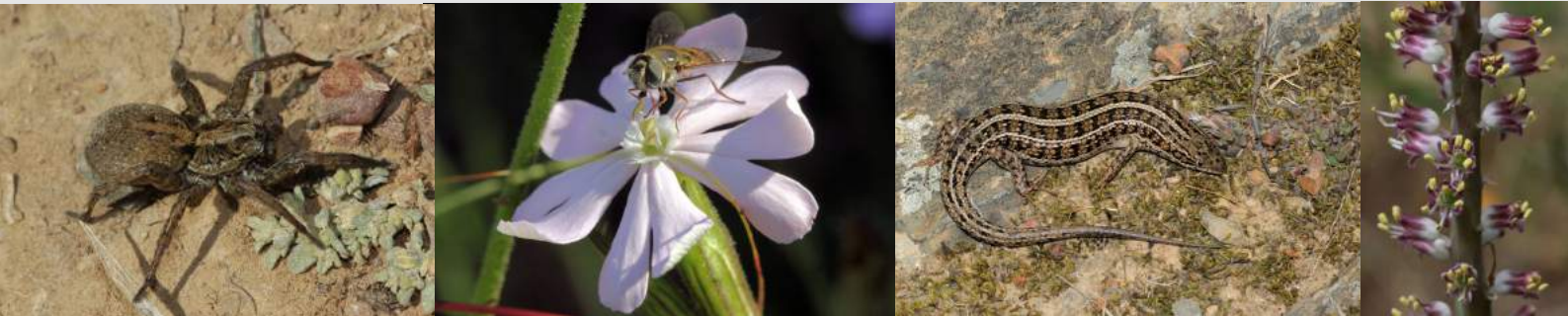
Left to right: Wolf Spider, Hover Fly on Silene, Cape Skink, Lachenalia nervosa (Endangered)