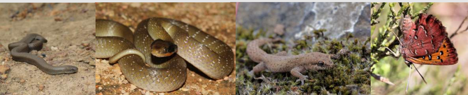
Left to right: Slug-eater, Red-Lipped Herald Snake, Oscillated Gecko, Dull Copper Butterfly Aloeides pierus